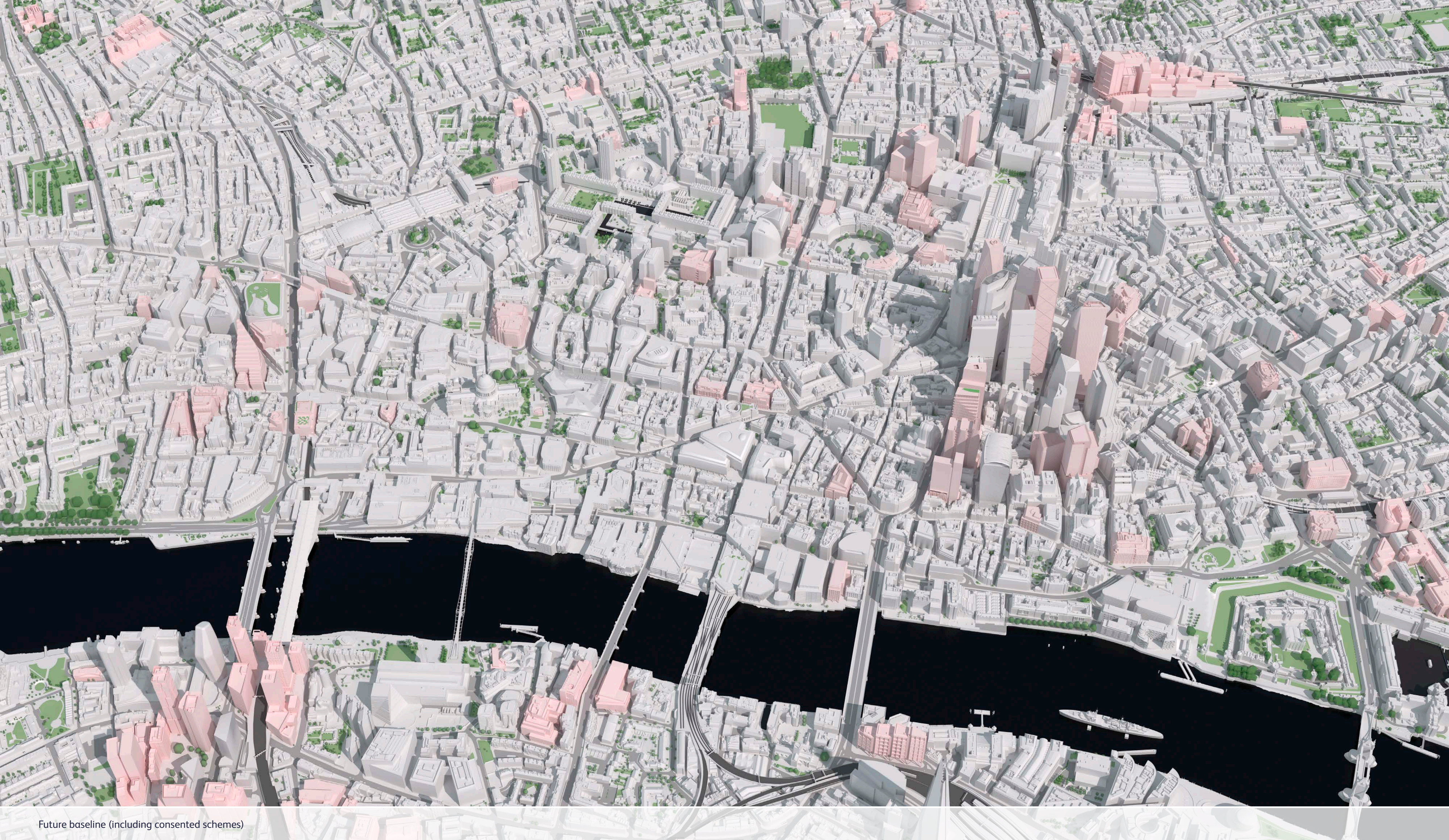
Future baseline (including consented schemes)