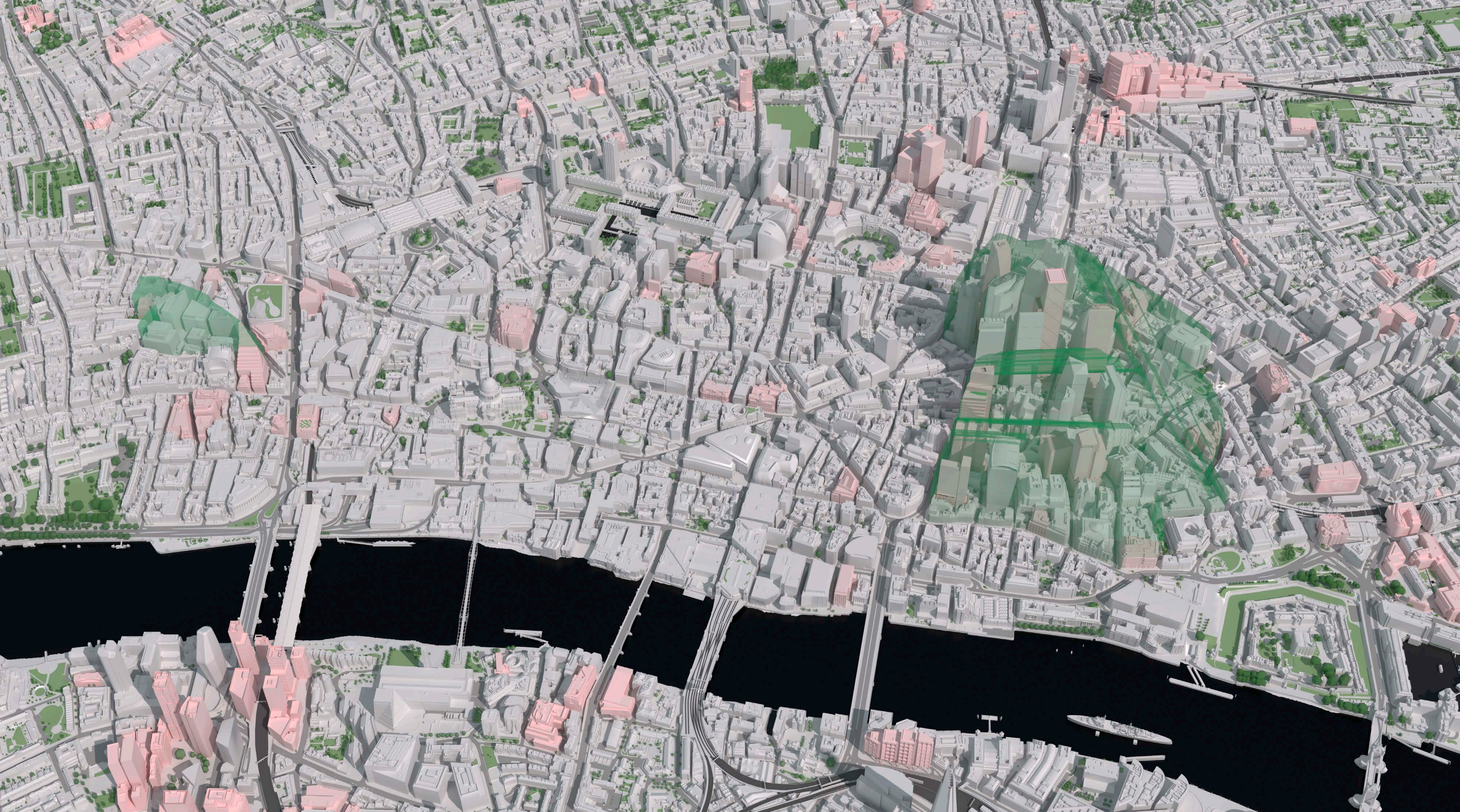
Indicative envelope A