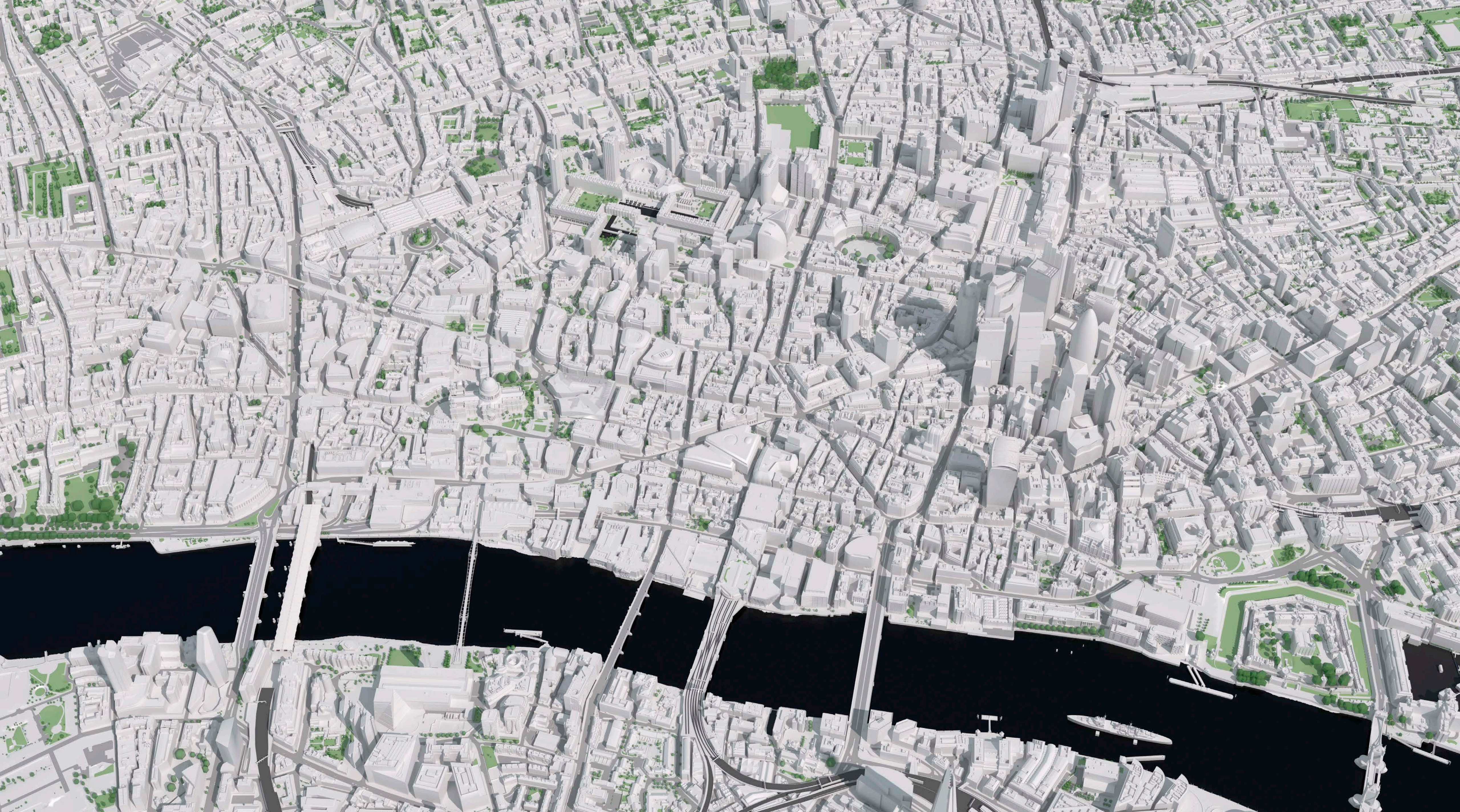
The City today