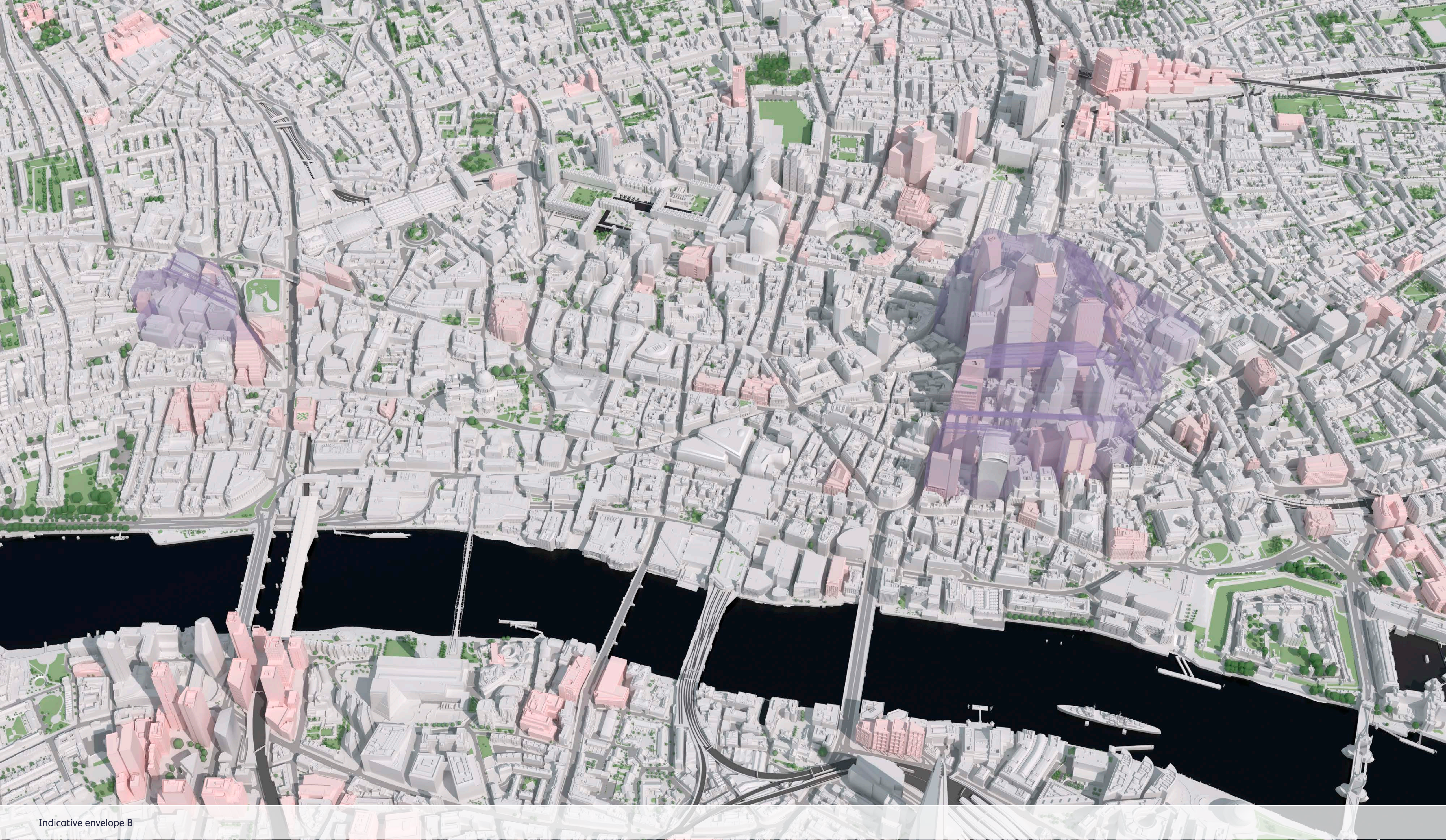
Indicative envelope B